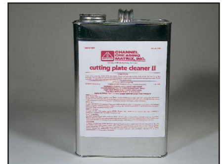
Cutting Plate Cleaner II is recommended for plate cleaning prior to using matrix. Residue-free and quick drying, allows matrix to adhere properly. Available in 1 gallon can, 5 gallon pail and 55 gallon drum.