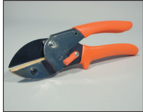
Economical cutting pliers for all sizes of Channel Creasing® Matrix.