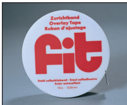
Hardened steel, .0015" x 5/16" x 33' rolls.