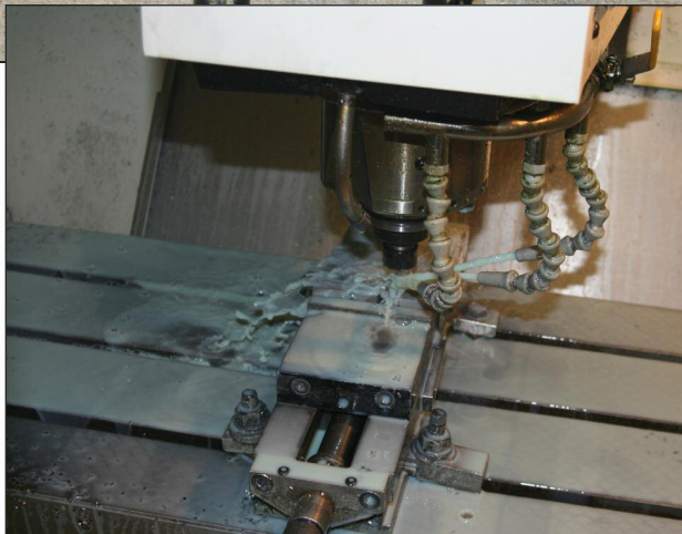
Wagner's 3-axis CNC mill with 4th axis servo, can process high carbon and low carbon metals as well as brass, plastics and many other materials.

Wagner has the equipment and know how to provide sophisticated CNC-based machining and processing for a wide variety of items and materials. Wagner can mill, lathe, grind, heat treat and laser engrave.