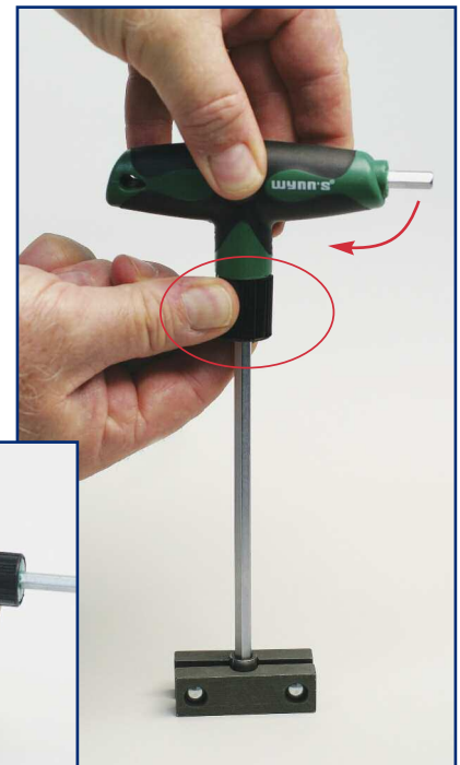
Tall side usage - with speed sleeve for quick quoin tightening!