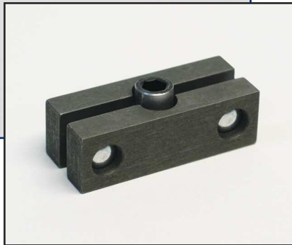
Wagner Mini-Quoin and T-Handle Key.

Wagner features a variety of Quoins & Keys for just about any application. Visit www.wagnerdiesupply.com for more information!