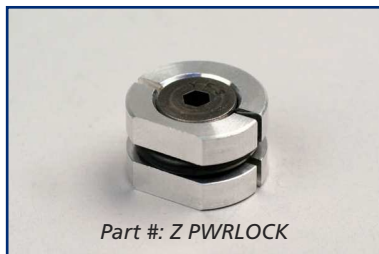
Part #: Z PWRLOCK

These compact quoins are great for locking-up small pieces of rule on die boards that may need to be replaced regularly.