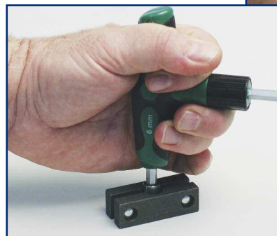
Short side usage - where torque is needed close up.

These compact quoins are great for locking-up small pieces of rule on die boards that may need to be replaced regularly.